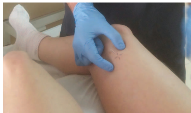
Figure 1. Trigger point dry needling intervention in the vastus medialis active myofascial trigger point of the affected anterior cruciate ligament knee.

The rehabilitation protocol was applied in both intervention groups (Rh+ TrP-DN and Rh groups) during a 5-week period (from Monday to Friday). This daily protocol consists of manual passive joint mobilization (20 repetitions of flexion-extension at 60 degree per second; supine position), active assisted joint mobilization (20 repetitions of flexion-extension at 60 degree per second; supine position), isometric contractions of quadriceps and hamstrings (12 repetitions × 3 series; interval for 12 seconds between repetitions; interval for 15 seconds between series; knee flexed at 15 degree and supine position), quadriceps electrical stimulation (Kotz electric current applied with 4 electrodes; medium basal frequency of 2500 Hz; pulse trains frequency of 50 Hz; intensity determined by the patient's threshold; maximum isometric contraction during 6 seconds of active electrical stimulation phase; interval duration 12 seconds; supine position; 15 minutes of treatment following 5 minutes of warm-up), closed kinetic chain strengthening eccentric exercise (squat exercise in standing position; knee flexed at 45 degree for 10 seconds; 15 repetitions with 20-second intervals), open kinetic chain