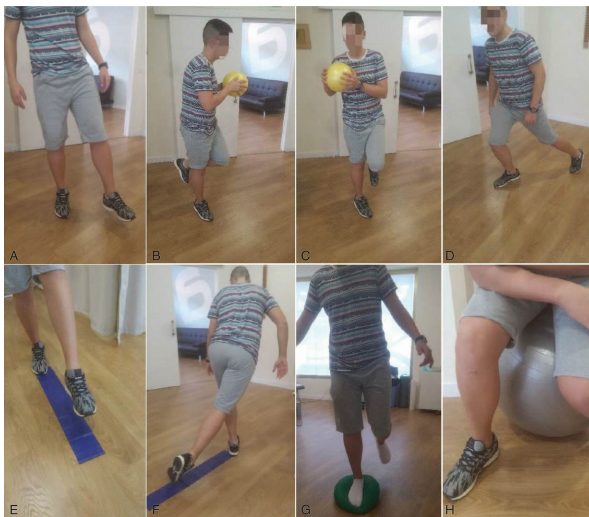
Figure 2. Progressive proprioceptive exercises protocol with the affected anterior cruciate ligament lower limb. (A) Monopodial exercise with open and closed eyes; (B) monopodial exercise with rotational trunk movement; (C) monopodial exercise associated with instability by external stimulus; (D) step-by-step sequence associated with squat eccentric exercise; (E) monopodial exercise associated with instability by different movement directions; (F) monopodial exercise associated with instability by different movement combinations; (G) monopodial exercise in standing position associated with instability platforms; and (H) monopodial exercise in sedestation position associated with instability platforms.

strengthening concentric exercise (10 repetitions \times 3 series from 90 degree flexion to 0 degree extension for quadriceps and from 0 degree extension to 90 degree flexion for hamstrings; 60% to 75% of maximum intensity, medium velocity and 3–5-minute intervals; sedestation position), proprioceptive exercises (15–20 minutes; 8 progressive exercises described in Fig. 2; 30 seconds per exercise; interval of 60 seconds between exercise), cycle ergometer, and walking aerobic exercise (20 minutes at medium intensity). [6]